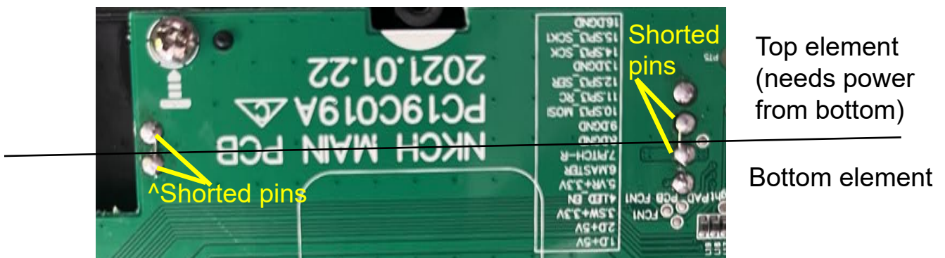
Option 1: Power and ground connections on PC board itself

We at Audio Innovate / Innofader will do our best to keep track of such installations and make notes of when this is required. Regardless, please do due diligence and double check on your end prior to installation since manufacturers may make running changes to these circuits without notifying us.